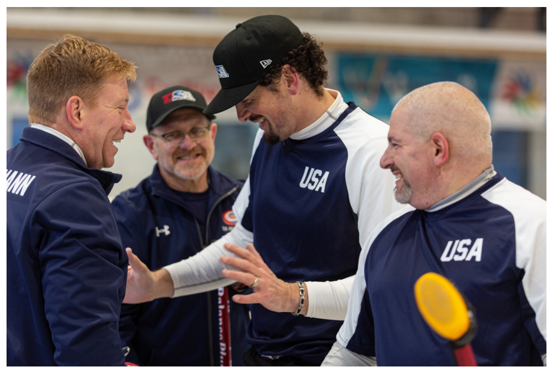
The USA Curling team laughs together during their 10 minutes break on December 13, 2019 at the 19th Winter Deaflympics in Madesimo, Italy.