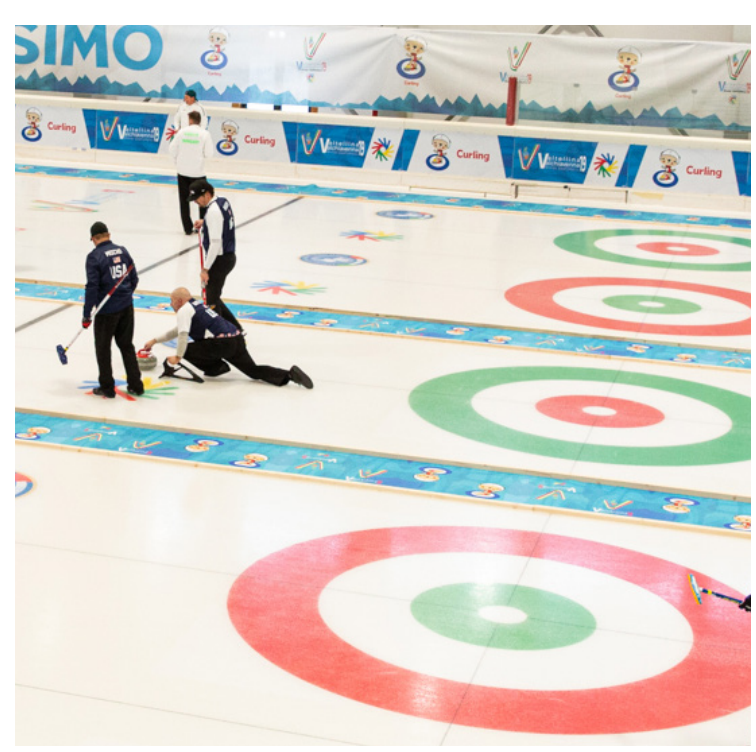
The Curling venue heats up with competition among 12 teams on December 13, 2019 at the 19th Winter Deaflympics in Madesimo, Italy.