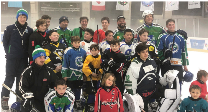
USA hockey coaches poses with the local Chiavenna hockey team on December 17, 2019 in Chiavenna, Italy.

The Deaflympic spirit extends far beyond the rink—as demonstrated by the coaches on ice. They serve as role models, not only for the Chiavenna youth, but for their own American players.