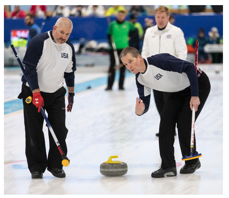
USA Deaf Curling takes on Hungary during the 19th Winter Deaflympics on Wednesday Dec 18, 2019 in Madesimo, Italy.