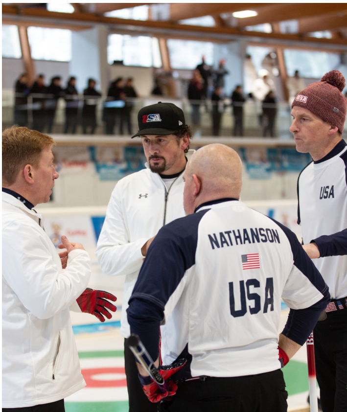
The USA Curling team discusses strategy during a stop in play.